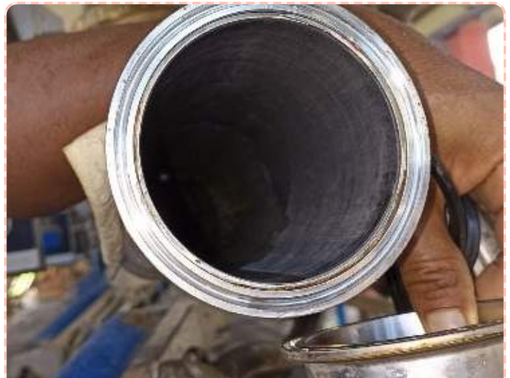
Pipe interior with milk scale buildup