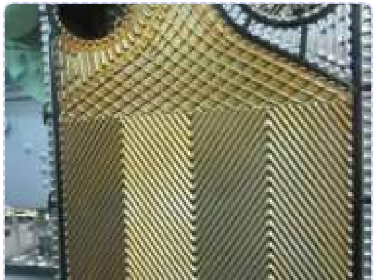
Cooling system before July 2011